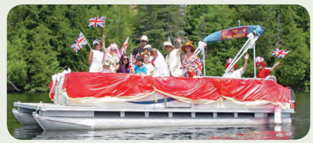
2<sup>nd</sup> Place - A Royal Wedding