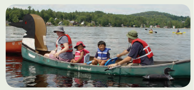
Non Motorized Entry - Mother Loon & Baby