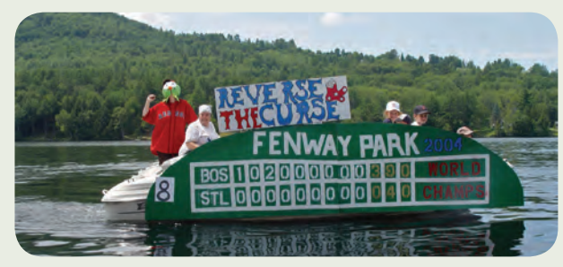
3<sup>rd</sup> Place - Reverse The Curse